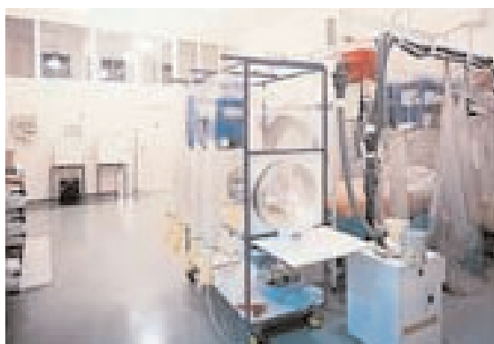
Top - Hereford Hospital Mortuaries, UK Bottom - Coppetts Wood Isolation Hospital, UK