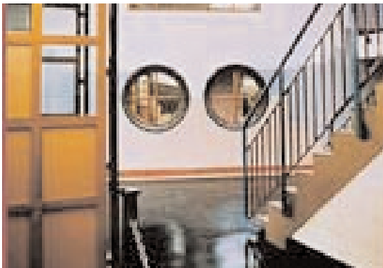
Top - Housing Estate Stairwell subject to severe graffiti abuse Bottom - Subsequent refurbishment using Armourlac