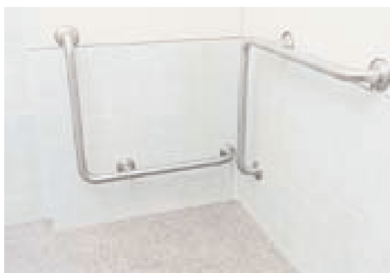
Top - Inmarsat, London Bottom - Shower Area Refurbishment, Tokyo