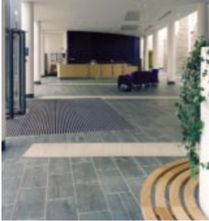
University of Leeds Business School - Leeds

C/S Pedimat is the perfect entrance flooring solution for buildings in moderate use such as offices, shops, hotels, banks and buildings societies, and where colour and design specification is often as critical as dirt stopping capabilities.