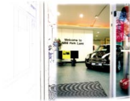
MINI Park Lane - London