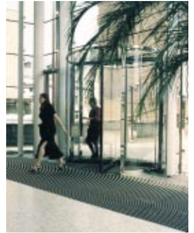
Princes Exchange - Leeds