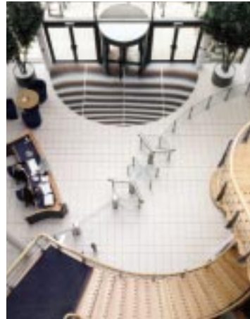
BT Call Centre - Nottingham